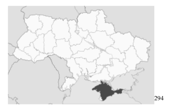
FIGURE 4: CRIMEA OBLAST

Similar to the resistance strategies that occurred in Odessa, the Crimean Oblast also resorted to passive countermeasures to curtail the onslaught of collectivization. Yet, unlike the Odessa oblast, these peasants resorted to mass-migrations, the rejection of kolkhoz membership, and theft, the peasants of Crimea often cleverly used the poor economic situation that surrounded them to their advantage and used violence against Soviet officials only in rare and desperate situations. An OGPU report from November 1929 illustrated this point with its regional analysis of "anti-Soviet" demonstrations against collectivization. In their report to Moscow, OGPU officials credited the Crimea with only eleven total incidents of " kulak terror" (over a month-long period), which included nine beatings, one assault, and one reported injury against Soviet officials in the area.<sup>295</sup> These numbers contrasted sharply with incidents across the rest of the Ukrainian SSR in which 142 separate events, which included eleven murders, nine injuries, seventy-