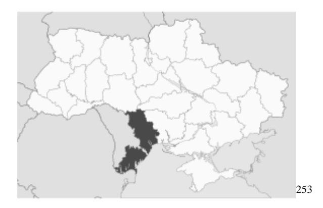
FIGURE 3: ODESSA OBLAST

During collectivization, peasants in the Odessa oblast exhibited numerous forms of passive resistance against the Soviet state. Documents that pertained to resistance strategies in this region were both numerous and extremely detailed. Specifically, these documents revealed major trends in the resistance structure of Odessa that demonstrated a clear and conscientious effort by the peasantry to engage the Soviet regime in both a discreet and passive manner. Although active elements of resistance certainly occurred in Odessa – such as the mass-strike of factory workers in July of 1930 – these activities remained relatively rare occurrences. <sup>254</sup> Consequently, accounts of active rebellion in Odessa remained largely absent from primary sources, such as letters, diaries,