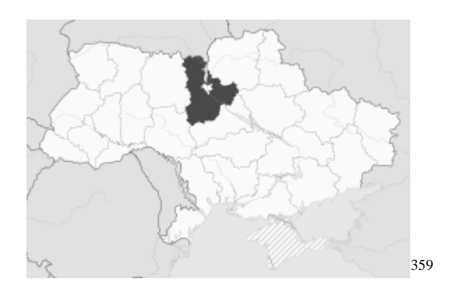
FIGURE 6: KIEV OBLAST

Similar to Dnipropetrovsk in the south, Kiev Oblast also experienced some of the strongest and most violent forms of resistance that occurred in the late 1920s and early 1930s. As the situation for peasants continued to deteriorate across the Ukraine during collectivization, active resistance served as a standard countermeasure to Soviet encroachment in Kiev as the peasantry looked for new strategies to preserve their traditional way of life.