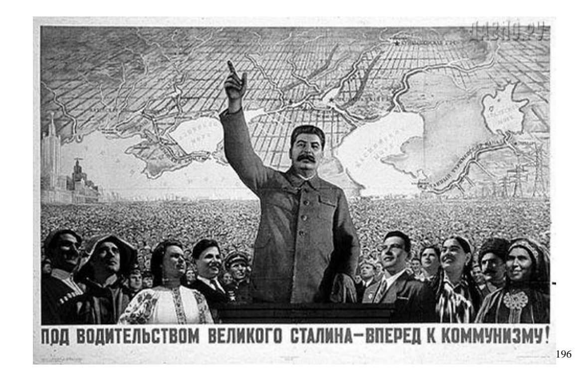
FIGURE 2: "Under the leadership of Great Stalin — Forward to Communism!"

In the months and years that followed Lenin's death in 1924, the Soviet Union underwent tremendous social, economic, and political changes as individuals fought for control over the state. Although Joseph Stalin assumed command of the Soviet government in 1924, his future remained uncertain due to interparty strife and the Soviet Union's political and economic vulnerabilities to both foreign and domestic threats. Although the NEP served as "a time of revival," historian David Marples argued that it also created "acute social problems" in the mid-1920s, such as high-unemployment, lowwages, lack of housing, and crime across the Soviet Union. This resulted in a "mass"