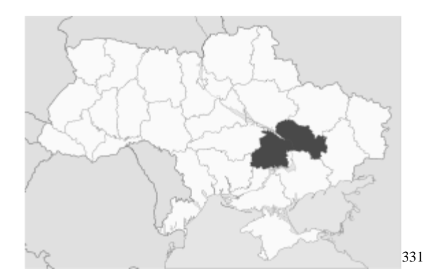
FIGURE 5: DNIPROPETROVSK OBLAST

Although passivity formed the backbone of peasant resistance in the Odessa and Crimea Oblasts, some of the strongest and most active forms of resistance emanated directly from the Dnipropetrovsk Oblast between 1927 and 1933. Although the exact number of incidents against government forces were unknown, the actions within this region remained well documented as they invoked a great deal of anxiety amongst both the Ukrainian and Soviet leadership.<sup>332</sup> Active forms of rebellion within Dnipropetrovsk also attracted the attention of political figures within the Soviet regime. In a private letter to Party First Secretary, Lazar Kaganovich, which spoke of the troubling situation in this region, Stalin expressed a deep concern about the social and political unrest in Dnipropetrovsk. As he stated, "unless we begin to straighten out the situation in the Ukraine, we may lose the Ukraine...things cannot go on this way."<sup>333</sup>